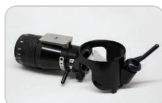
High precision micromanipulators