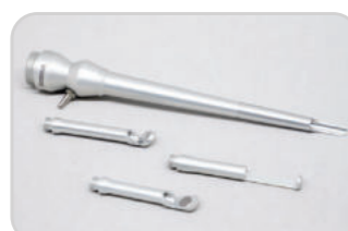
Specialized handpiece sets