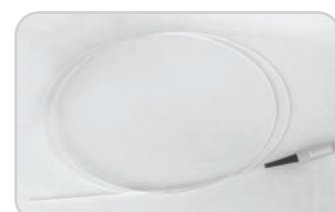
Flexible fibers with pilot beam