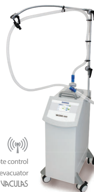
Wireless remote control of smoke evacuator VACULAS